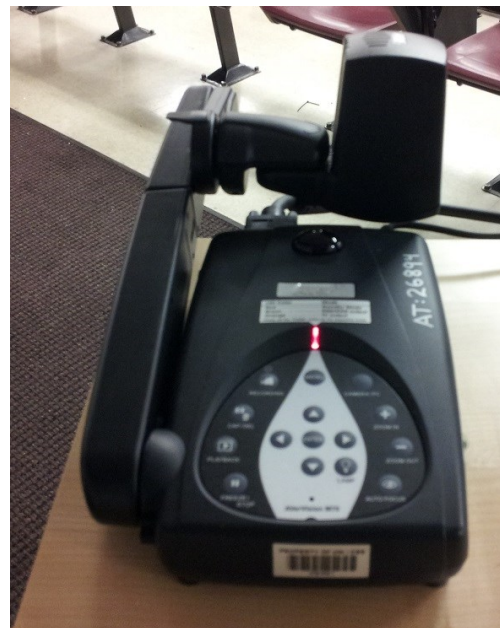
Digital Document Camera