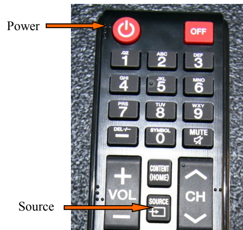
Remote control for the monitor.

Please remember to turn off the monitor and media devices when you are done using them! This saves energy and prolongs media device lifespan significantly.